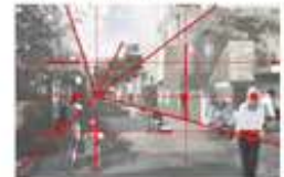
Fig. 375. Schema prospettico e del centro visivo dell'attenzione (regola dei terzi). Gli elementi sussidiari sono collocati in posizioni strategiche.

[IMMAGINE 0(3) – Ideal type of sustainable city. Analysis of the render for Millennium Village in London ]