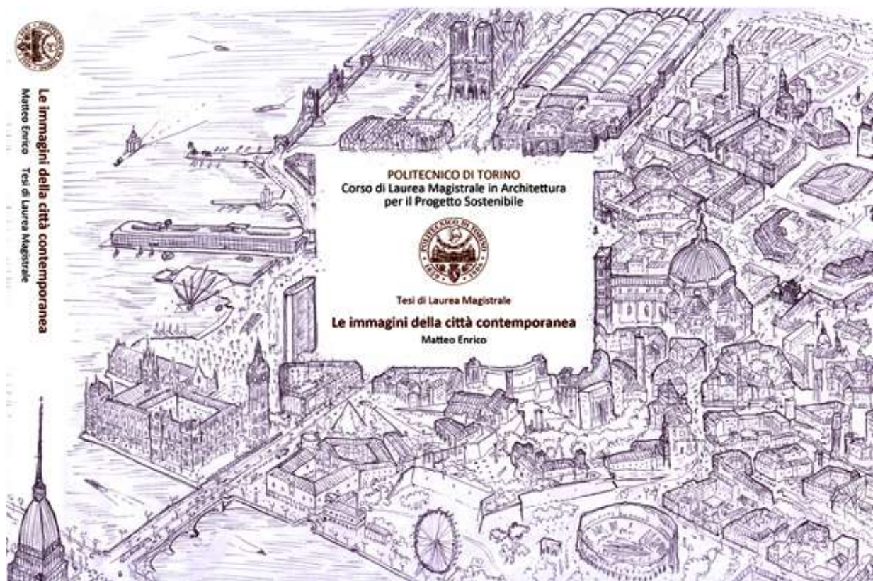
[IMMAGINE 0(1) – Thesis's cover]

How to represent the metropolis of XXI century? Photographs, movies, postcards and also music videos are building a richer collective imagery shared by media. Urban designer and city administrators need to communicate urban transformations directly to citizens. The use of render relies on citizens' desires, telling in images how their city is being transformed into the city of dreams.