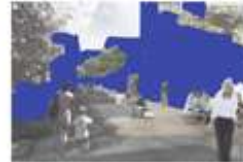
Fig. 372. Elementi primari visibili: rampicanti, alberi e personaggi coprono in parte gli edifici.