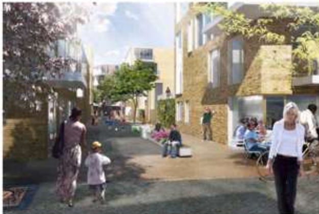
Fig. 369. Il render più noto dell'intervento rappresenta una scena di ipotetica vita del quartiere in estate.

For this reason the great architectural firms make use of communication professionals for images, not only architects but photographers, painters, cartoonists, video makers and especially advertising experts. Cities have become showcases of architectural and urban interventions that seek the approval of citizens and tourists, investors and politicians. In the images' society, where television and web are the primary means of communication, projects need to use a visual communication more and more sophisticated and efficient.