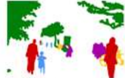
Fig. 373. Elementi sussidiari (biciclette in giallo, persone sedute in viola, bambini in azzurro e donne in rosso) e elementi naturali (in verde) sono essenziali nella narrazione grafica.