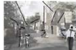
Fig. 374. Linee verticali ed oblique indirizzano lo sguardo verso punti specifici della composizione. I palmi costituiscono punti fermi.